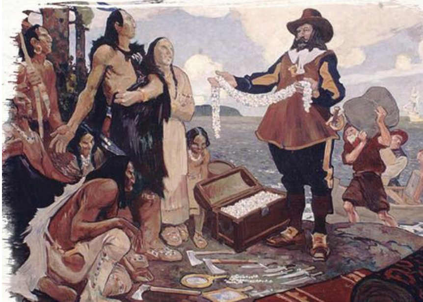
Champlain Trading with the Indians by CW Jeffreys, 1911 (courtesy Library and Archives Canada/C-103059).

Essential Question: Why did the French and other Europeans come to North America, and how did they interact with the First Peoples?