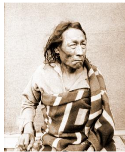
Mistahimaskwa (Big Bear),